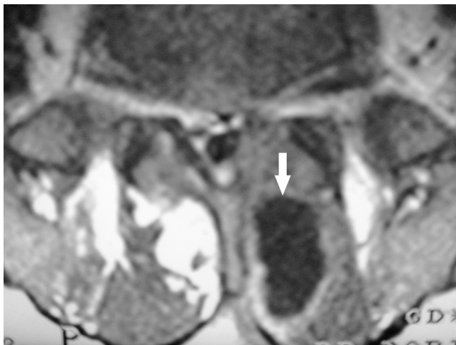
Figure 2. Axial T1-weighted magnetic resonance image with contrast medium demonstrating a ring-enhanced, hypointense ellipsoid lesion with a central hypointense nidus in the left paravertebral soft tissue at the level of L-4.